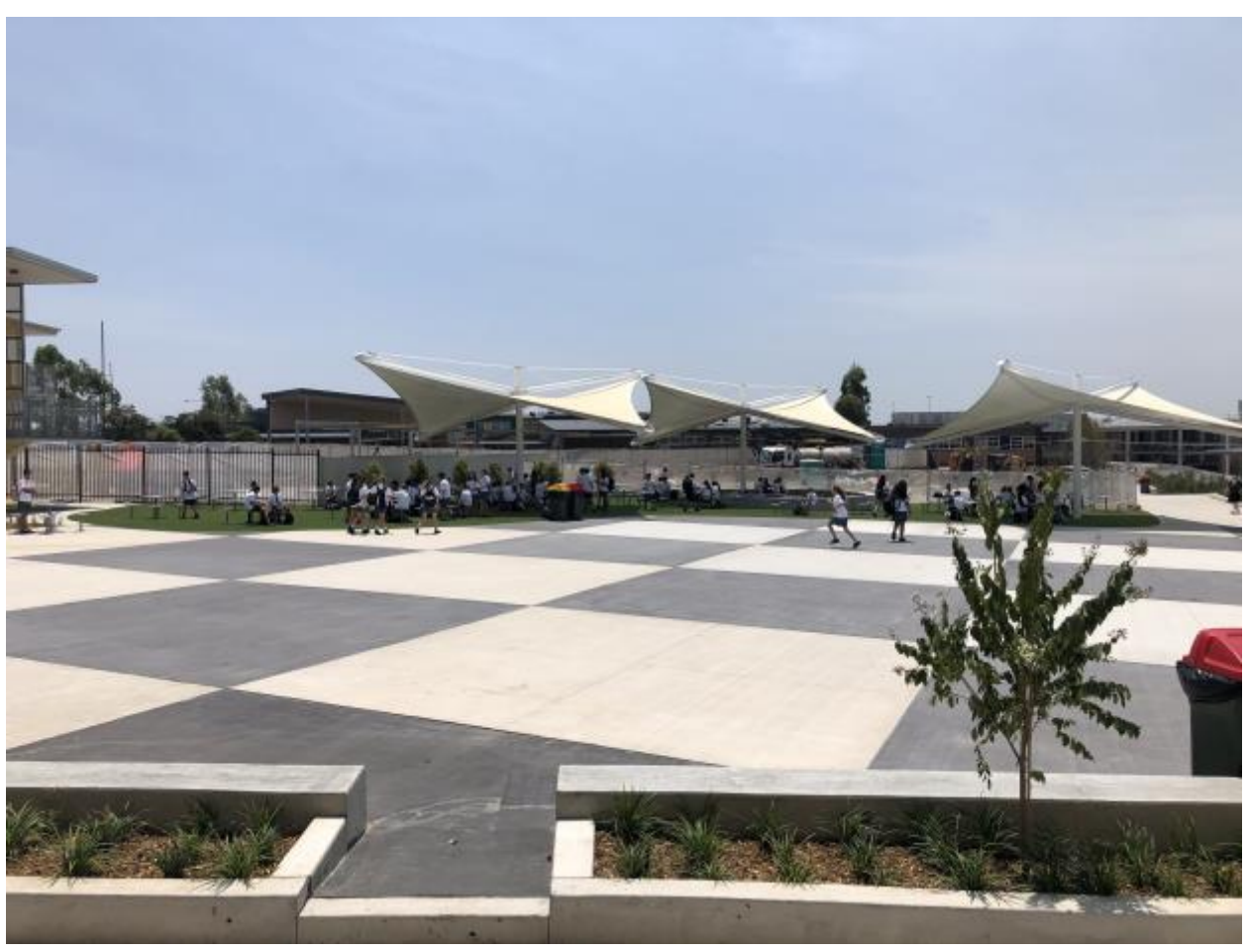
Oran Park High School